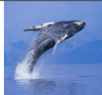
Turks and Caicos Jan. 31 – Feb 6, 2015

Price: $3,379 per person/double occupancy